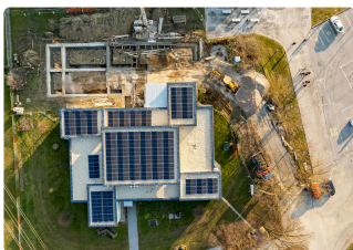
COMMERCIAL & INDUSTRIAL