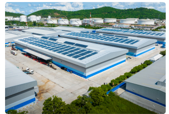
WAREHOUSES & COLD STORAGES